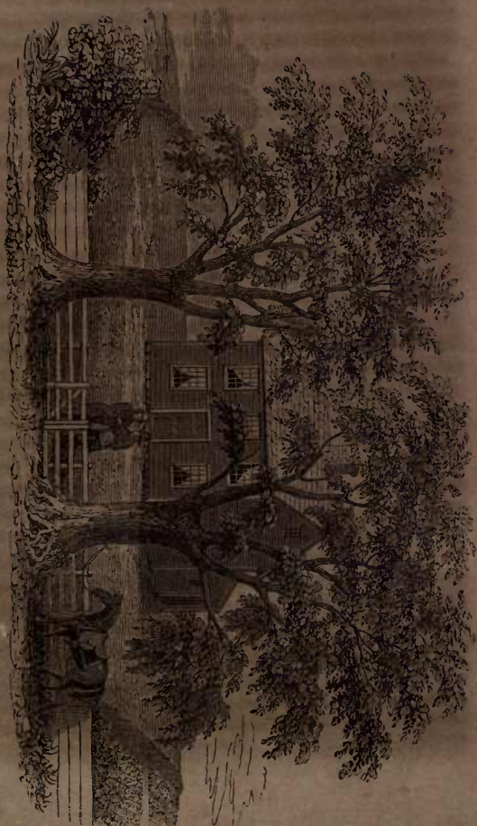
President Edwards' House, Northampton, Massachusetts.