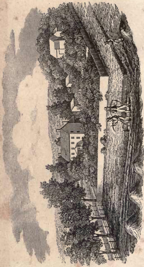
— View of the Parsonage in Cranbury, New-Jersey, July, 1833. Occupying the ground where Brainerd preached to the Indians, 1716.